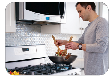
Custom Griddle and Wok Grate