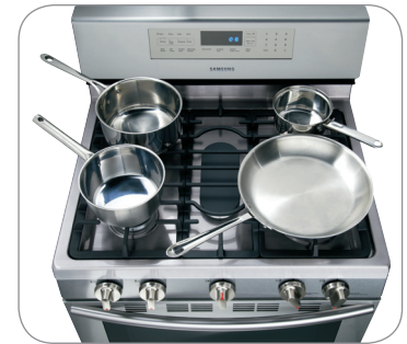
Five Burner Cooktop